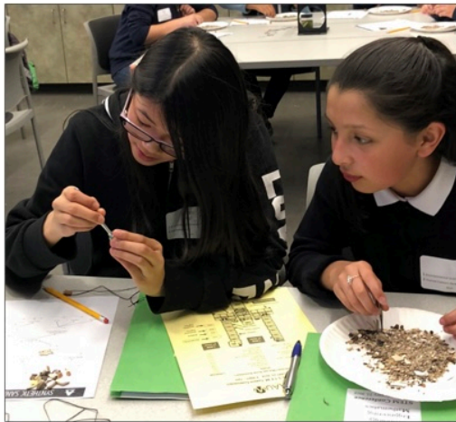
Activities at the STEM Career Conference